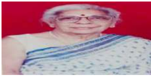
iii) Sita Ram Jindal Foundation