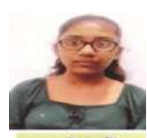
Palak 6475/640 3rd in College